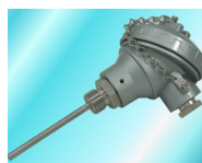
TTM4 & TWE4 Probe