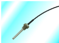
TTE2 & TWE2 Probe