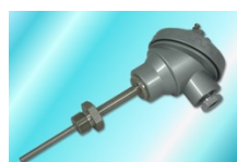
TTE5 & TWE5 Probe