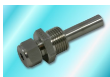
Pockets / Thermowells